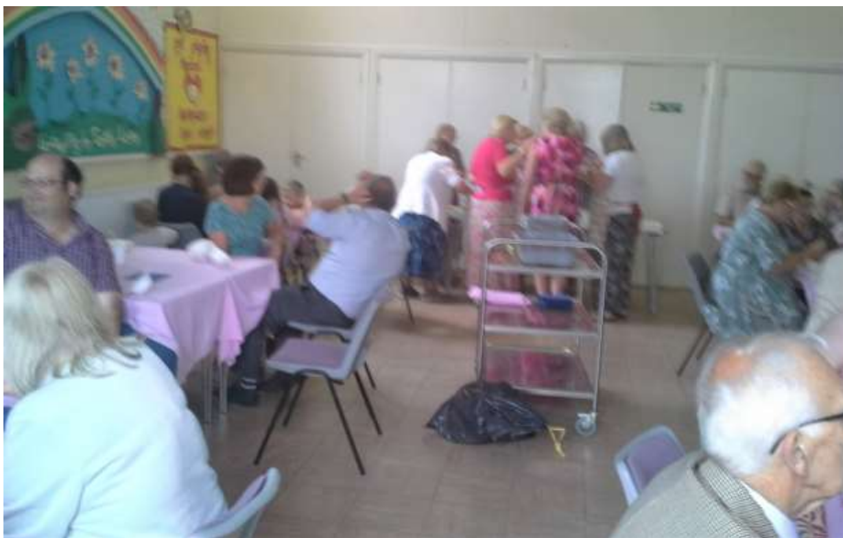
Friends enjoying the church Anniversary lunch