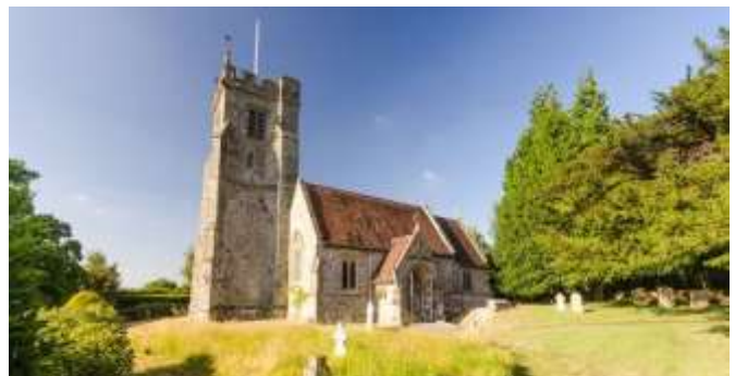
The Parish Church of St Nicholas Childe Okeford

4. For why! the Lord our God is good; his mercy is forever sure; his truth at all times firmly stood, and shall from age to age endure.